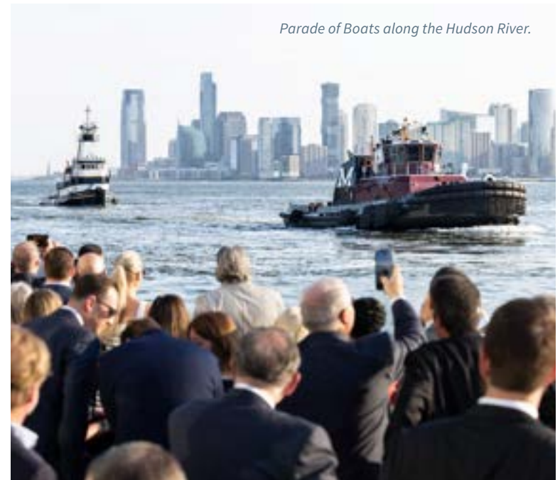
Parade of Boats along the Hudson River.