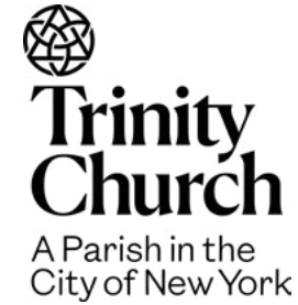
Trinity Church, New York City