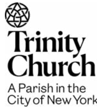
Trinity Church, New York City